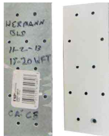
Figure 3. Front and back of Medallions. These mending plates can be purchased at local hardware stores.