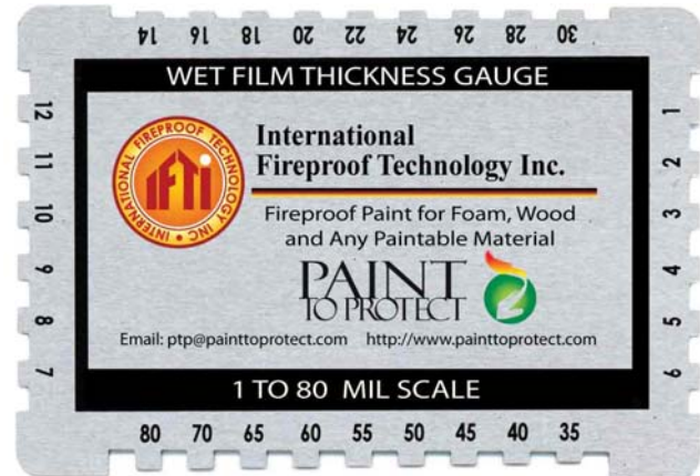
Figure 1. Notch Type Wet Film gauge

How to Measuring Wet Film Thickness of Coatings on Spray Foam Insulation using the Medallion Method